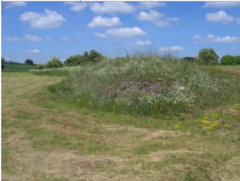
Photo of island with acidophilous grassland (Valdíkov, Třebíč district, Czech Republic).