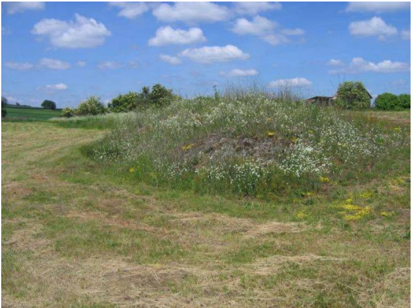
Photo of patch with acidophilous grassland (Valdíkovo, Třebíč district, Czech Republic).

Vegetation samples of acidophilous grasslands (16-25m 2 ) recorded in 2004-2007.